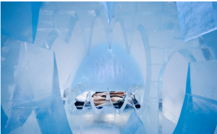
INTO THE ICE Artists: Shingo Saito & Natsuki Saiton, Japan.